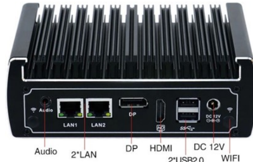
Audio 2*LAN DP HDMI 2*USB2.0 DC 12V WIFI