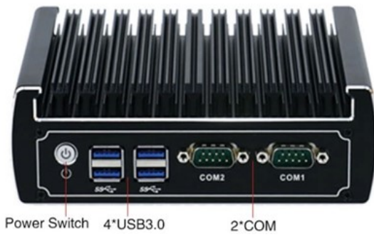
Power Switch 4*USB3.0 2*COM